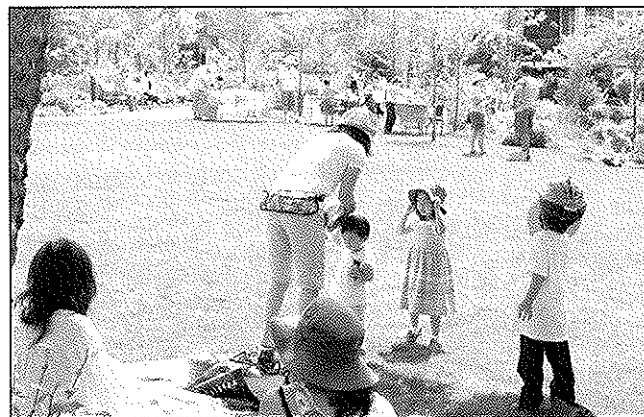
Canada Day Celebration