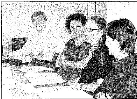
UNA Board meeting