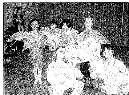
Dancers at Lunar New Year Celebration