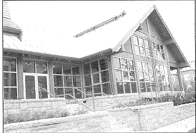
Old Barn Community Centre

The Directors meet on the 2nd Tuesday of the month at 5:00 p.m. in the Old Barn Community Centre located at 6308 Thunderbird Boulevard. UNA members and the public are invited to attend. Members of the public and delegations are welcome to speak at 7:00 p.m. Meeting agenda and minutes are published on the UNA website at www.myuna.ca .