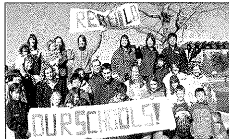
Concerned parents gathered in February to show support for new community schools.

We have also learned the hard lesson that without adequate political representation our needs will continue to be sidelined by those with more direct access to the centers of local government. One way we can start to increase our influence, is to become involved in the upcoming school board elections. To this end, the UNA Schools Action Committee will be hosting an all-party candidates forum during the upcoming school board elections. Watch for notices.